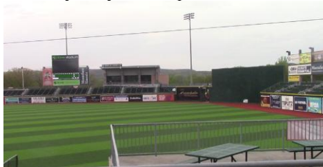
Clover Stadium Field

The major league baseball season is already a month old, but the Frontier League season is ready to begin. The NY Boulders season is kicking off on May 7 against the Brockton Rox after an exhibition game against the NYPD on Saturday May 2, at 6 pm.