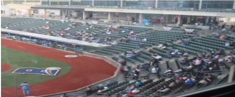
Fans enjoying the game

A few hundred fans were present for the annual NY Boulders/NYPD Finest exhibition baseball game that took place at Clover Stadium. This game has been played since 2012. It is the only game that not made up if the game needs to be canceled for whatever reason.